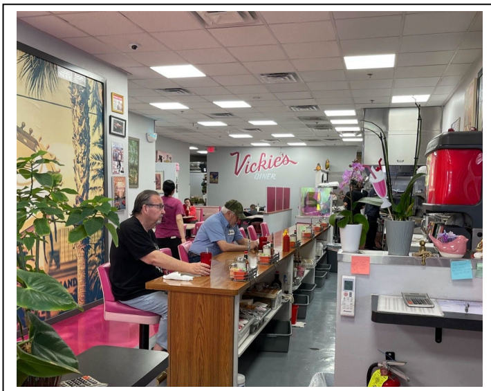
Vickie's Diner includes tables and booths, but also counter seating.